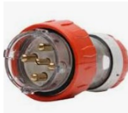
PDL 4 PIN