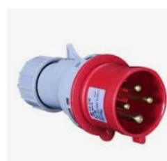
CEEFORM 4 PIN