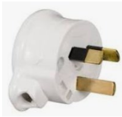
PDL 3 PIN